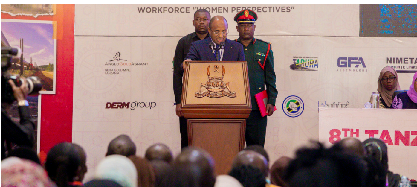
The esteemed guest of honour, H.E. Dr. Hussein Ali Mwinyi, President of Zanzibar and Chairman of the Revolutionary Council, officially opened the event at the Golden Tulip Airport Hotel.