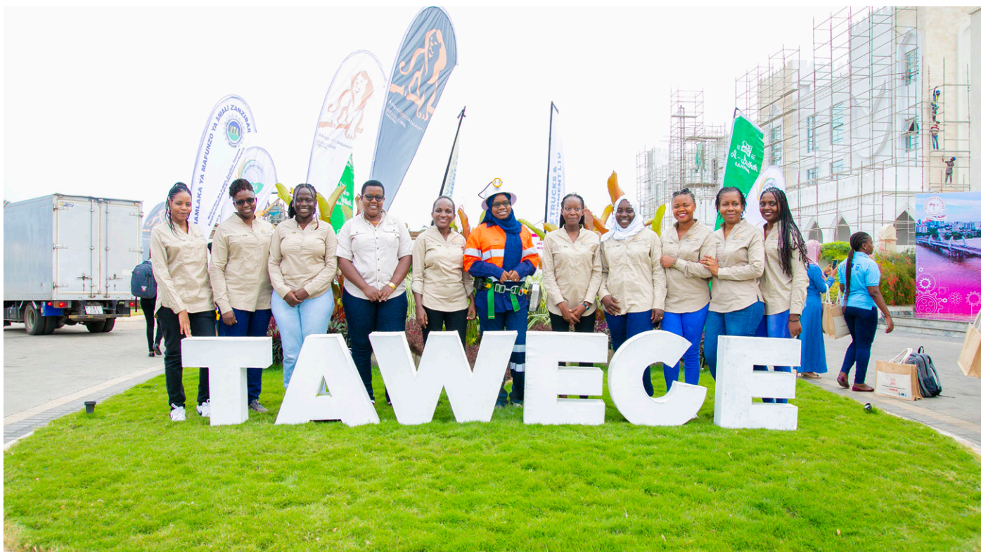
GGML's contingent of Engineers on the opening day of the 8th Tanzania Women Engineers Convention and Exhibition that took place in Zanzibar.

Zanzibar, August 5, 2023 - The 8th Tanzania Women Engineers Convention and Exhibition (TAWECE) was successfully held in Zanzibar from 3rd to 5th August 2023 under the theme, “The Power of Diversity and Inclusion in Engineering Workforce: Women Perspectives.” The convention, which was attended by over 800 participants from mainland Tanzania as well as international guests from Zambia and Ghana, provided a platform to promote gender equality and women’s empowerment in engineering.